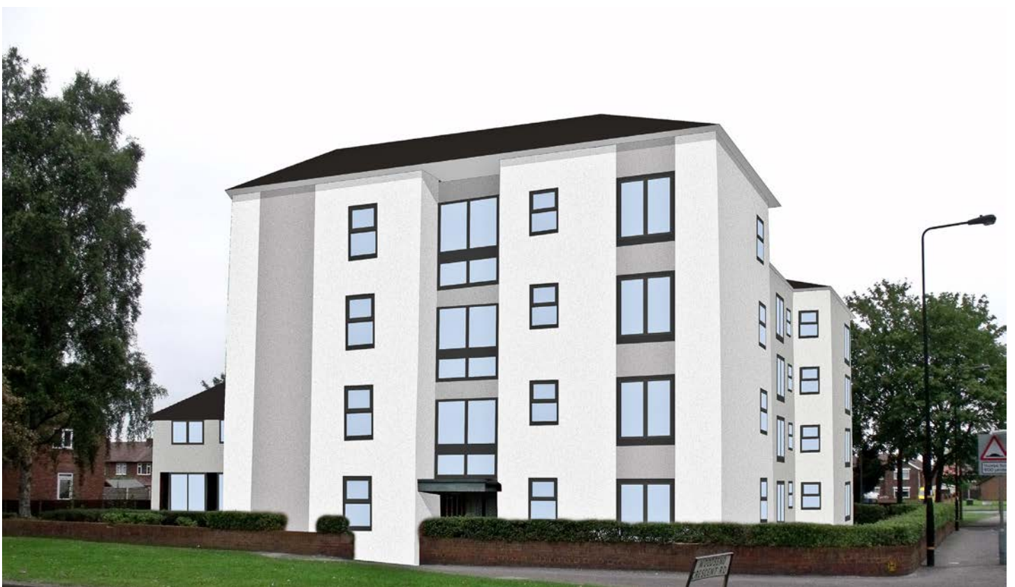
FRONT ELEVATION - Proposed design