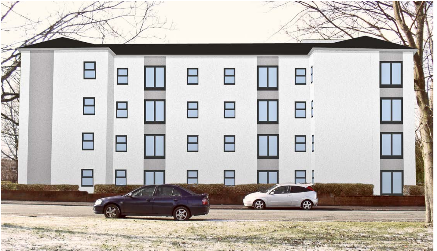
SIDE ELEVATION - Proposed design