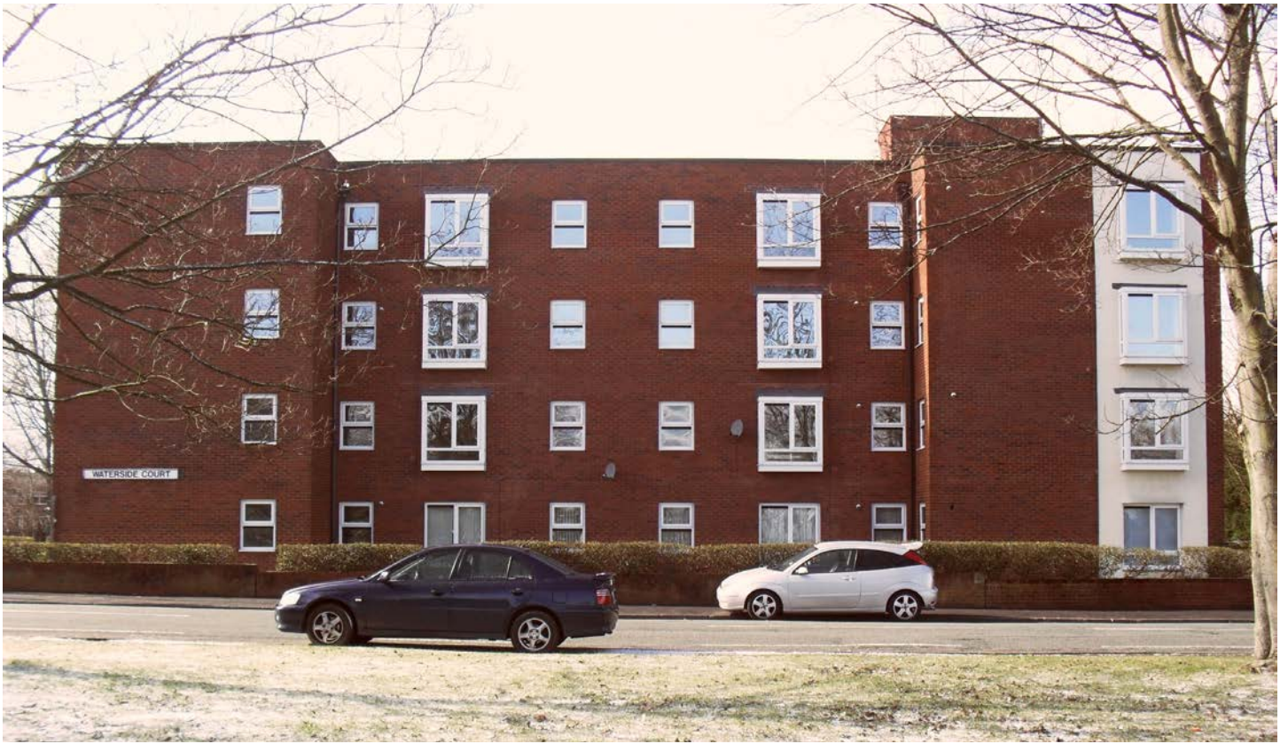
SIDE ELEVATION - Existing building before development