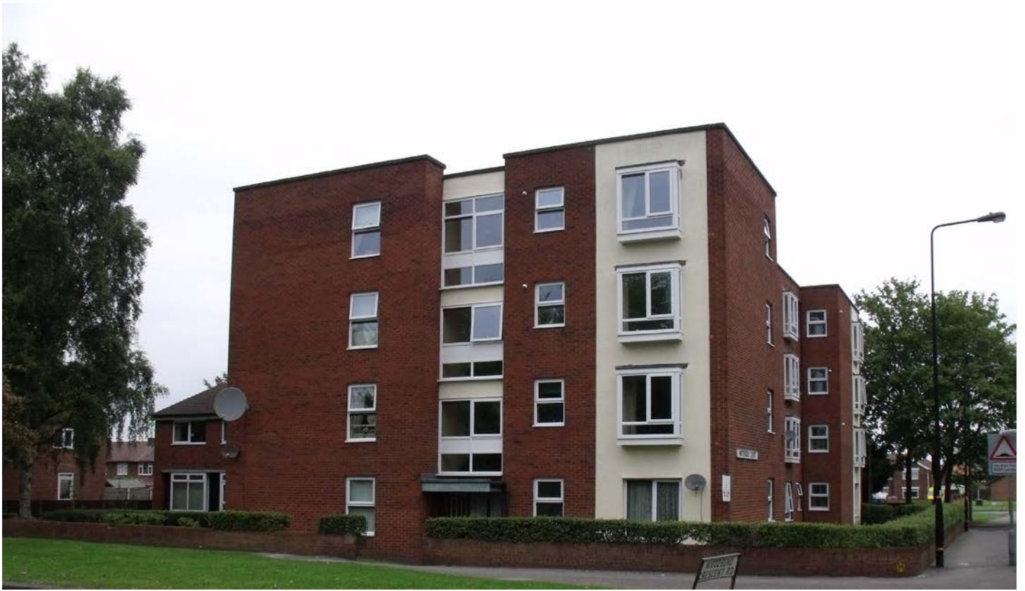
FRONT ELEVATION - Existing building before development